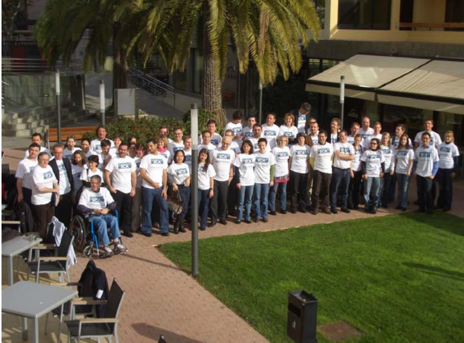
Illustration of the work done

EUROSCA final meeting in Palma 5-6 December 2008